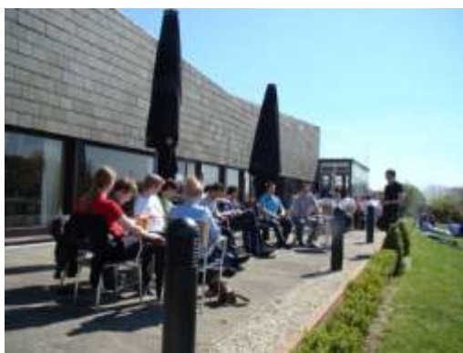
Superior facilities at the WMA

Some of the WMA campus facilities are accommodations for the students, library, gym, water sports centre, restaurant/cafeteria and the popular Mariners Café Bar where it felt really nice to have a beer in the sun with the students after our presentations.