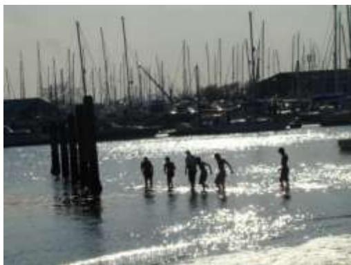
Early summer in England