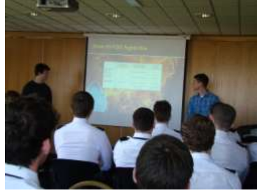
Sometimes we forgot to look straight at the audience...