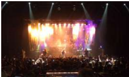
Children of Bodom at the HMV Forum