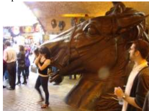
Plenty of cool things to see at Camden

There are lots of stands with food from around the world to choose from and, of course, many tents with clothes, souvenirs and stuff to look through. After a while wandering around, we were satisfied and went back. It was, however, an interesting and exciting trip.