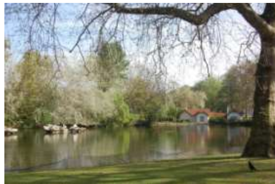
St. James's Park

We passed by quite a lot of bridges and different kinds of buildings. The sight was very delightful. When we came to the Palace of Westminster (the one with the Big Ben) we took a turn and went in to the St. James's Park. There we enjoyed the green zone and quite a garden in the middle of the rushing city!