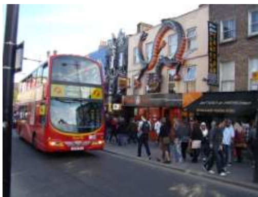
Saturday afternoon in Camden Town

As one of the main capitals of Europe, London offers one of the most attractive night life, not only because of the big party but because of the multi-cultural and diverse activities to join.