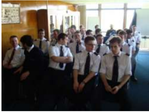
All dressed up and nowhere to go

We liked this idea of studies since they are already employed, the company pays for their studies and gives them salary as well. In this way they have to perform to improve for their employers that they are serious with their chosen work career.