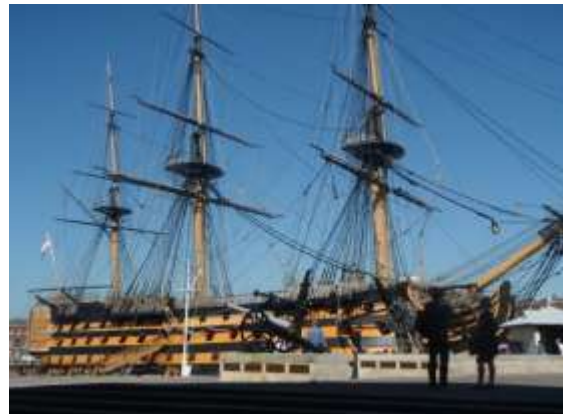
A magnificent sight

On Friday afternoon in Portsmouth we did a study tour on the museum ship HMS Victory. This was Lord Nelson's flag ship and also the ship where he died at the battle of Trafalgar on 21 st of October 1805.