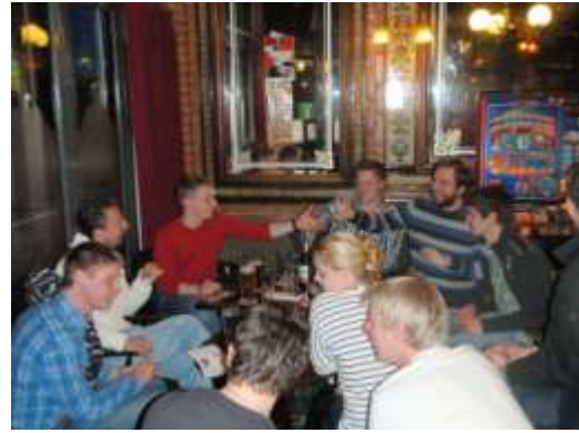
“The carpenters” was a typical English pub.

The food in England was a bit different that our food here in Finland. They like very much fried food, such as fried chicken, fish and potatoes. In Camden town, London there were a lot of small stalls, offering different kind of food from all over the world, for example Indian, Chinese, Mexican and of course English Fish and Chips. In England it was very hard to find “good old” house made food. The Englishmen like to have an after work beer and goes to the pub to talk and have fun.