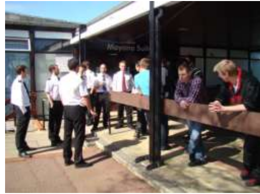
English and Scandinavian Engineering Students

About 2200 people were there to watch the bands. The bands performed really good and it's a nice memory from the whole trip. If you ever find yourself in Kentish Town, you should really consider a visit to the HMV Forum.