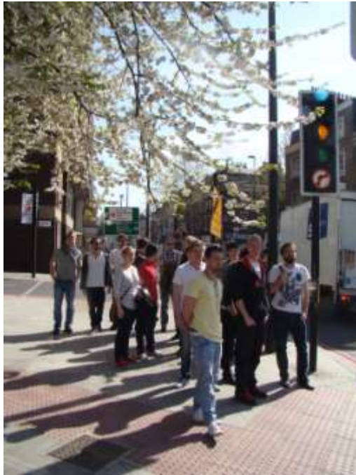
Very nice and flowery

Some opted to go to one of the hundreds concerts in London, others chose for going to city center and go to different pubs, also a good chosen option was stay chilling on a typical English Pub in front of the hostel, or others just stay on hostel's pub exchanging experiences with other travelers. And finally one of the best parts of the night is talking next day with your mates about their night and sharing experiences.