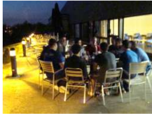
It was warm enough to sit outside

We had promised to offer some Finnish special products at the school pub in the evening, so we offered salmiak vodka shot from a tray to the locals. They liked us a lot and we were invited to join them to the local pubs in the village.