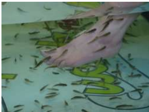
This type of foot massage was new to us