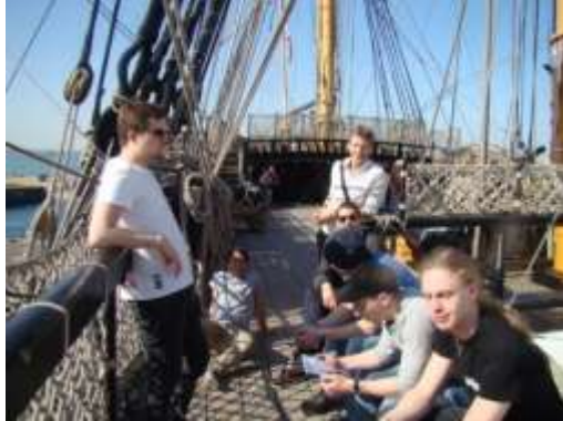
Chilling on “sun deck” on the Victory

HMS Victory was placed in a dry dock in Portsmouth where she still rests. She is now the oldest commissioned warship in the world, she still attracts about 350 000 visitors every year.