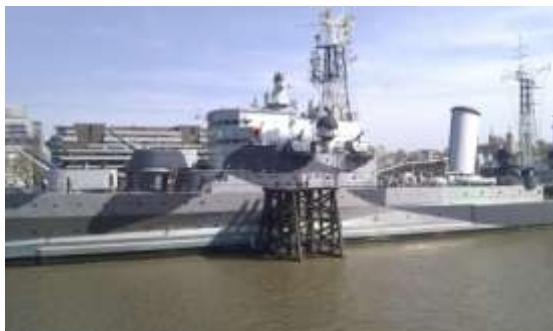
HMS Belfast, moored in the Thames

We started our last day in London by taking a look at the famous Tower Bridge. After that we decided to go along the river Thames towards the old center of the city and explore London by foot. We saw the warship HMS Belfast (C35) which is a museum ship today and some of us visited the ship.