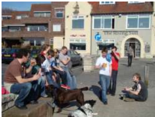
Dog owners always pass the pub