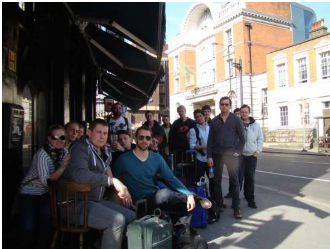
Departure from the London hostel near King's Cross

A trip as part of a course module in English at the Åland Maritime Academy, Finland