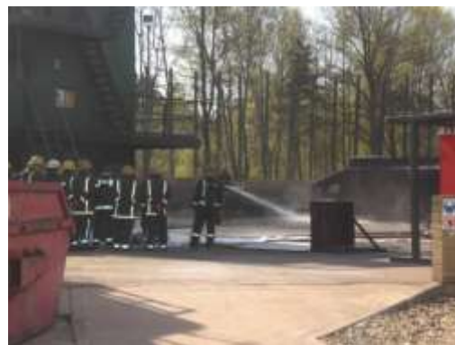
Fire-fighting training with real diesel oil

engines, electrical appliances and other mechanical work.