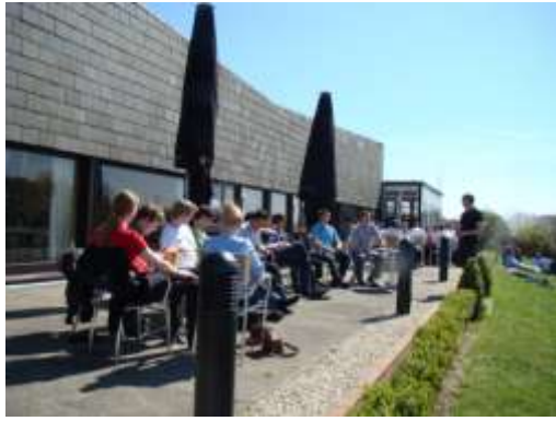
The sunny terrace